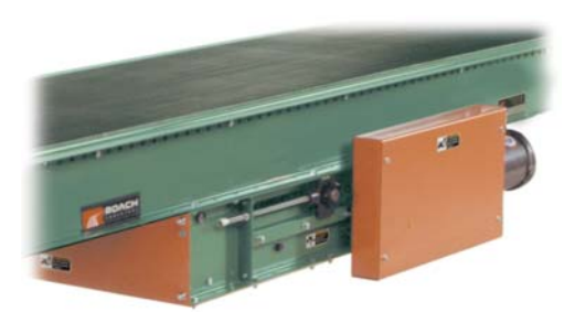
OPTIONAL CENTER DRIVE