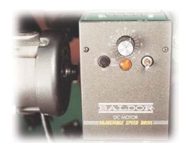
OPTIONAL DC VARIABLE SPEED CONTROLLER

ELECTRICAL CONTROLS: Magnetic starter (one direction or reversible); One direction manual starter; Momentary start/stop push button station; Forward/reversing /stop push button station. Mounting and pre-wiring for units up to 12' long.units up to 12' long.