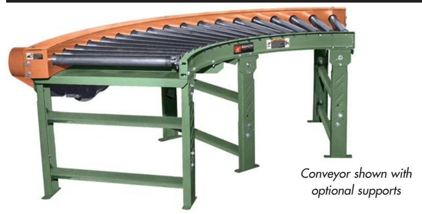
251CDLRC, heavy duty chain driven live roller curve, transports heavy unit loads. Heavy castings, drums and other loads not requiring product orientation may be effectively conveyed on this conveyor.